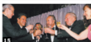
June 15: At the annual awards gala of the Americas Society, the 350 guests toasted David Rockefeller, the society's founder, in celebration of his 94th birthday.