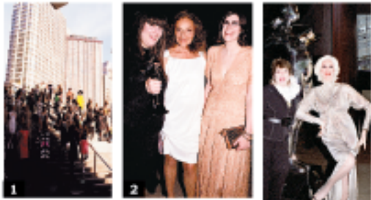
June 15: The annual gala of the Council of Fashion Designers of America was at Alice Tully Hall. The guests were greeted by dozens of models standing on the outdoor promlike amphitheater, wearing designers' latest work.