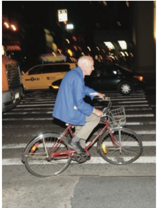
Bill Cunningham: “I’m looking for something that has beauty.”

“On the Street”—along with Cunningham’s society column, “Evening Hours”—is New York’s high-school yearbook, an exuberant, sometimes retroactively embarrassing chronicle of the way we looked. Class of 1992: velvet neck ribbons, leopard prints, black jeans, catsuits, knotted shirts, tote bags, berets (will they ever come back, after Monica?). Class of 2000: clamdiggers, beaded fringe, postcard prints, jean jackets, fish-net stockings, flower brooches (this was the height of “Sex and the City”). The column, in its way, is as much a portrait of New York at a given moment in time as any sociological tract or census—a snapshot of the city. On September 16, 2001, Cunningham ran a collage of signs (“OUR FINEST HOUR,” “WE ARE STRONGER NOW”) and flags (on bandannas, on buildings, on bikes) that makes one as sad and proud, looking at it now, as it did when it was pub-