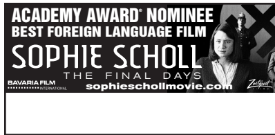
1 col x 1" = 1" S.A.U.