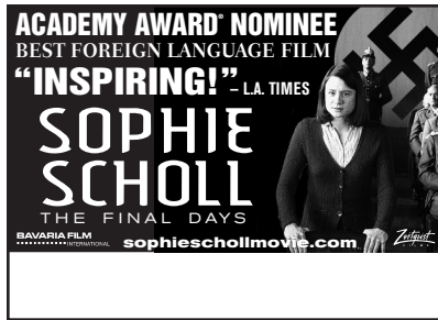
1 col x 1.5" = 1.5" S.A.U.