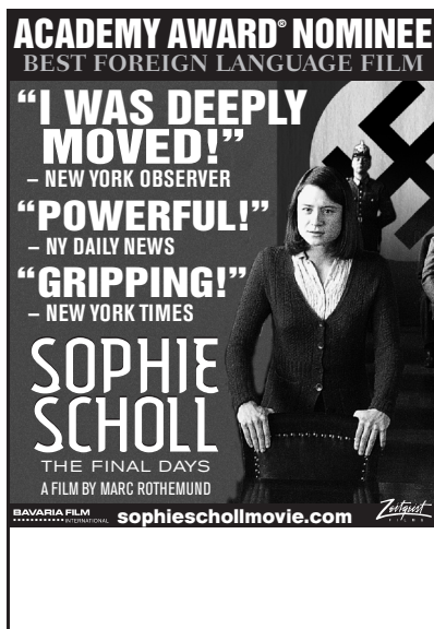
1 col x 3" = 3" S.A.U.