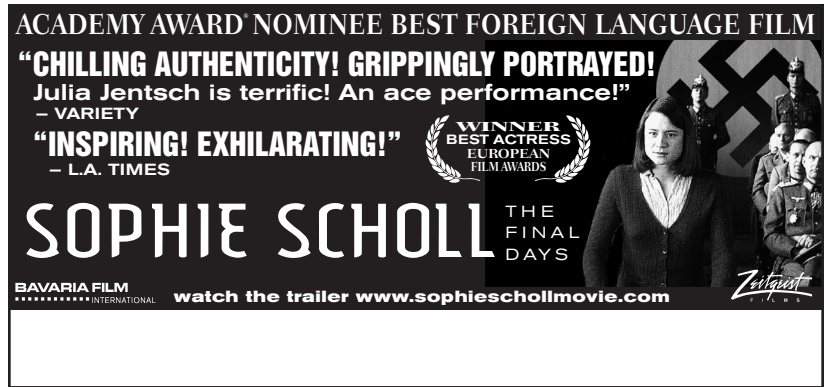
2 col x 2" = 4" S.A.U.