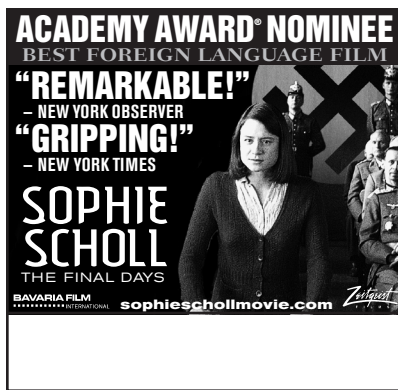
1 col x 2" = 2" S.A.U.